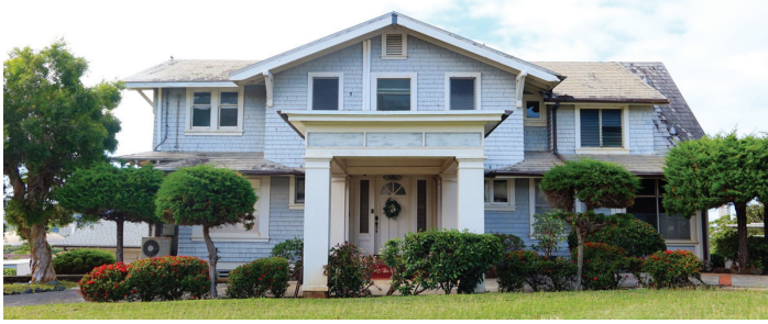
The Jennie McLean Residence – A prominent College Hills home reflecting Mānoa’s early residential character.