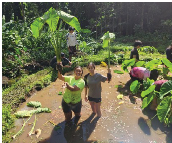
Hālau Kū Māna students hard at work in the ʻAihualama Loʻi.

This Mānoa Village would not necessarily be a building, but rather a supportive network created by and for our community. This Village allows neighbors to both give and receive support for inevitable life changes such as assistance with rides to appointments, help with technology, small household tasks, deliveries, or referrals to trusted services. Just as