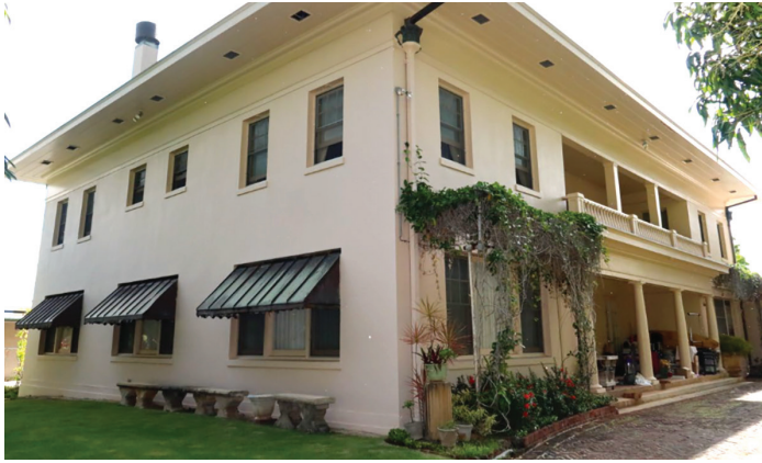
The Allen W. T. and Lily Bottomley Residence – A distinguished early 20th-century residence with formal architectural elements.