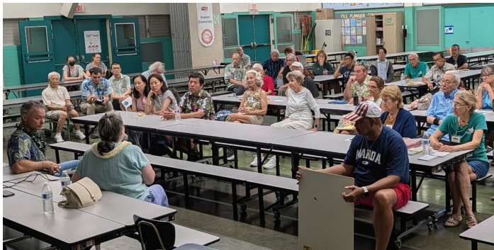
Community members attend Mālama Mānoa's panel discussion at Noelani Elementary

On October 25, Mālama Mānoa hosted a community panel at Noelani Elementary School to explore one of the most pressing questions facing the valley today: how do we accommodate the need for housing while preserving the character that makes Mānoa unique?