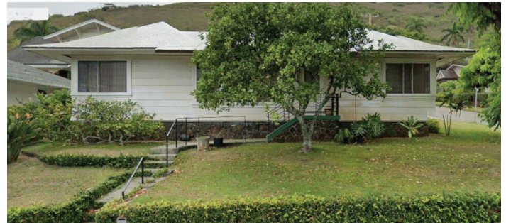
The Walter J. and Emma Snyder Residence – A pre-war home showcasing early modern influences in Mānoa.

The Raymond P. and Victoria Tuthill Residence is a single-story, L-shaped mid-century modern house on a hillside in upper Mānoa. The 1950 wood-framed structure designed by Hawai’i architect Alfred Preis features excellent craftsmanship with redwood paneling, a low-slope gabled roof, wood deck, and exterior patio. The property includes original glass block interior features, shoji doors, and stained fir flooring. The terraced front yard contains natural volcanic rock, a fern grove with an ‘auwai, and tropical flora including kalo, ginger, and ti.